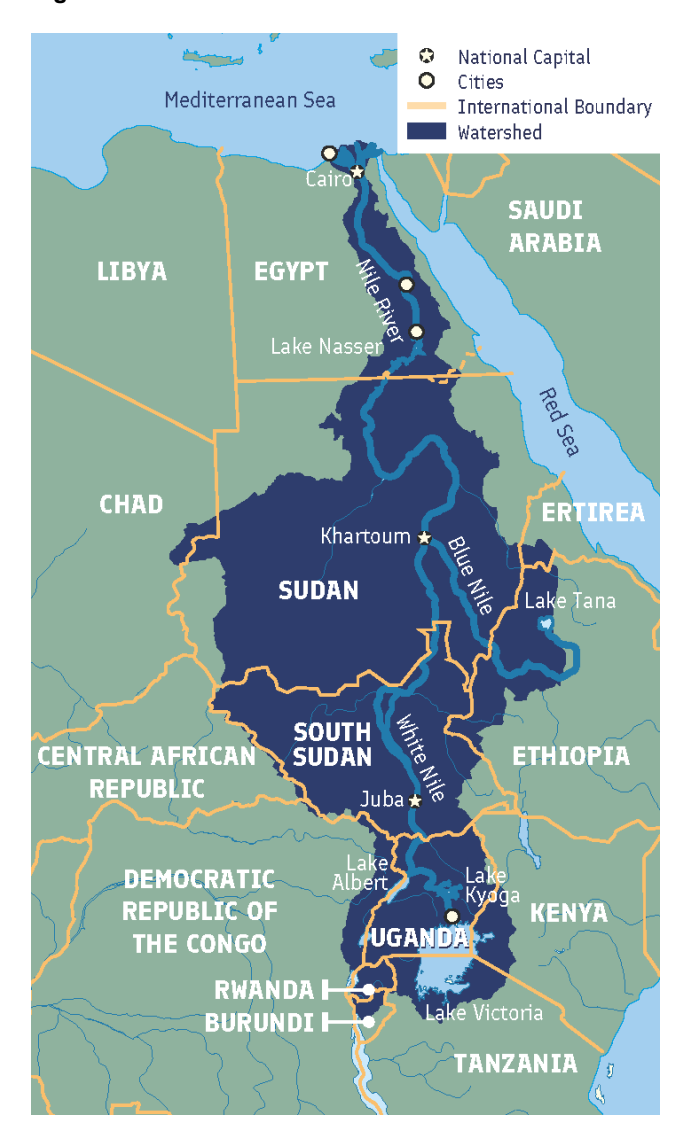
Figure 4 Nile River Basin

The Nile River Basin covers the territory of 12 countries: Egypt, Sudan, South Sudan, Eritrea, Ethiopia, Central African Republic, Kenya, Uganda, Rwanda, Burundi, Congo, and Tanzania, or a land area of 3,200,000 km² (Figure 4 Nile River Basin). In 2016, the basin was home to more than 257 million people or 20% of the African continent's population. With its 6,695 km, the Nile is the longest river on earth.