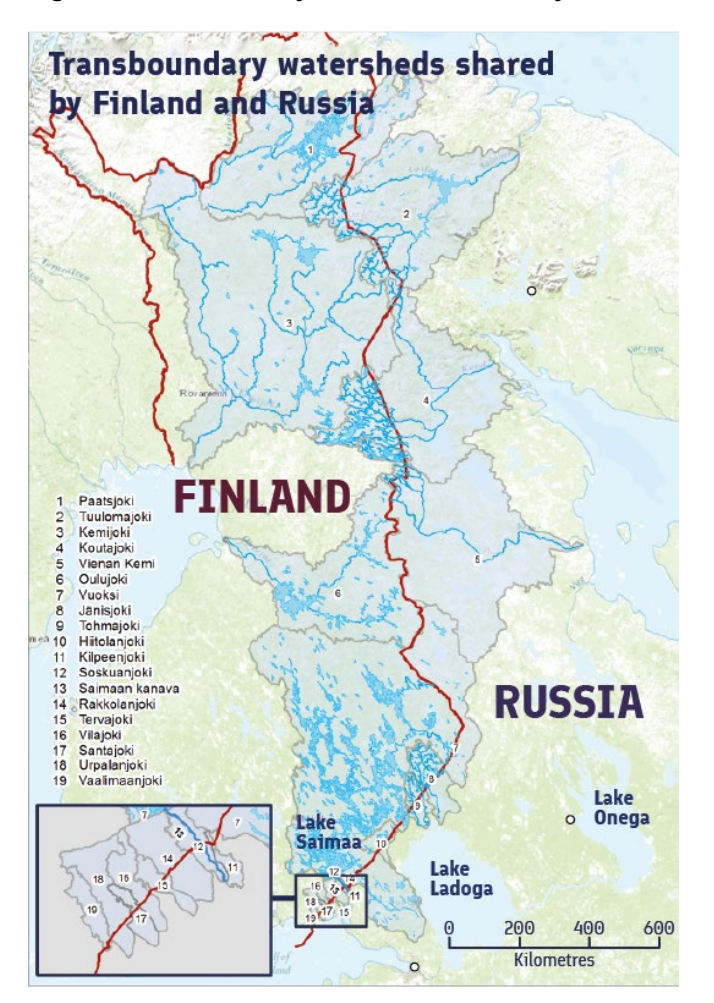
Figure 1 Transboundary watersheds shared by Finland and Russia

Finland and Russia share 19 major transboundary watersheds, shown in Figure 1 Transboundary watersheds shared by Finland and Russia. Most of them flow from Finland to Russia, like the Vuoksi River, the most important one. After Finland gained its independence from Russia in 1917, the Vuoksi was Finland's internal river — an essential source of hydropower, a national pride filled with cultural value for the young nation. After World War II, Finland lost part of its Eastern land areas to the Soviet Union, including most of the Vuoksi River and two of the four newly built hydropower dams. As a result, Finland's hydropower output was reduced by 30%.