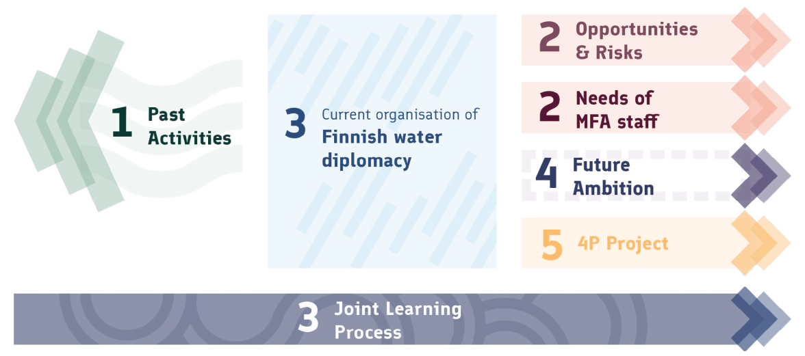
Figure 5 The coherence of the objectives in the evaluation.