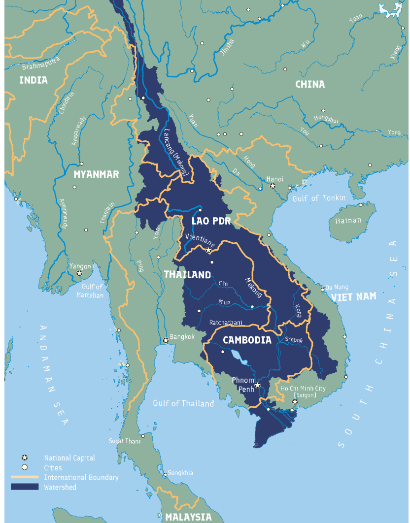
Figure 3 Mekong river basin