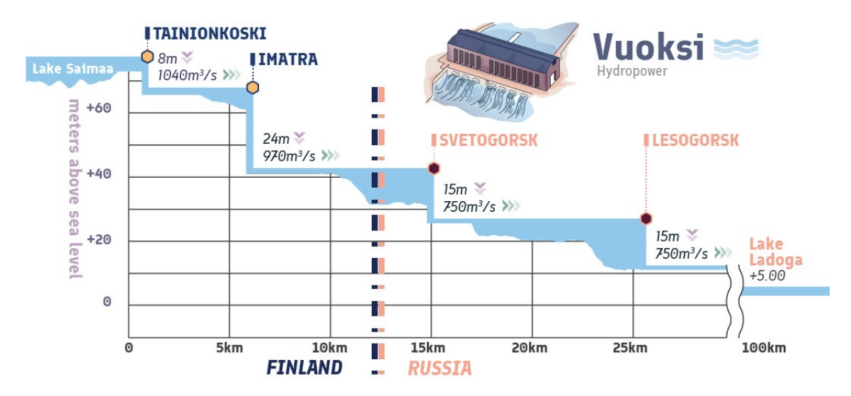
Figure 2 Profile and hydropower plants of the Vuoksi