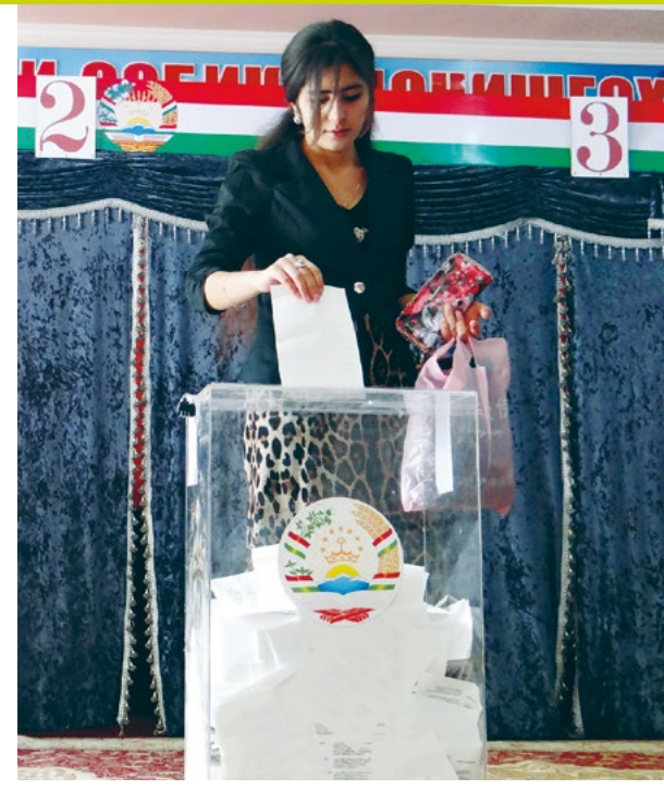
Finland continues its project cooperation with the OSCE. International election monitoring is a key task of the organisation. A photo taken at the 2013 presidential election in Tajikistan.

OSCE COOPERATION emphasises support to independent institutions specialised in human rights as well as to field operations in Central Asia. Finland continues funding the OSCE's extra-budgetary projects carried out by the field operations, independent institutions and the OSCE Secretariat in Eastern Europe and Central Asia. OSCE project cooperation promotes security and stability by supporting civil society, democracy and the status of minorities and women. 2 MEUR have been earmarked for OSCE project cooperation for 2014-2017.