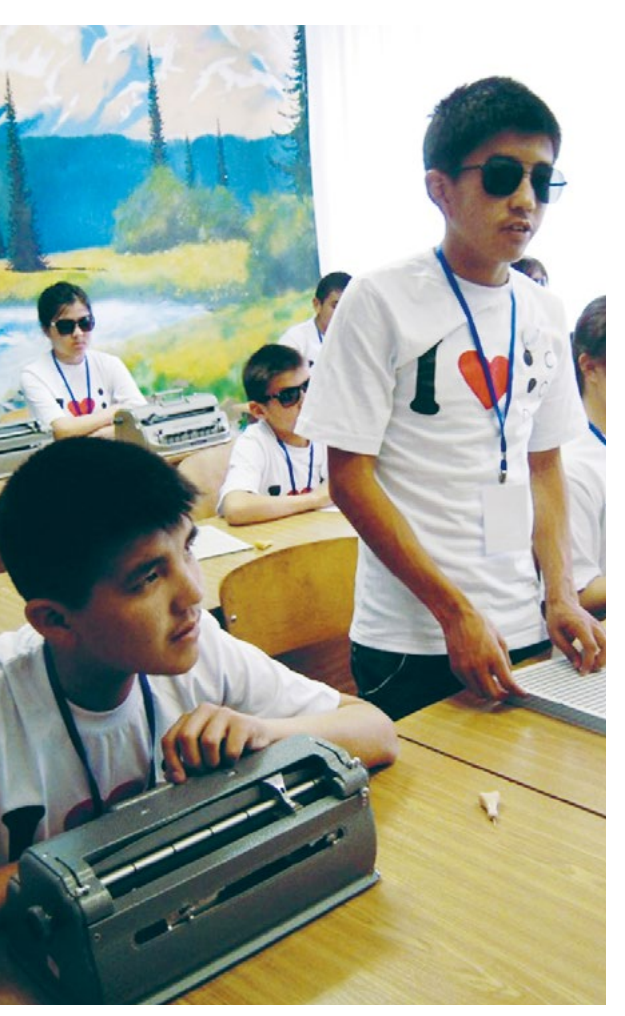
Finland has supported improving the situation of the visually impaired in Kyrgyzstan through the Fund for Local Cooperation. The photograph was taken at the Blind Olympics in 2013.

Finland has two embassies in the partner countries: one in Kiev, the capital of Ukraine, and one in Astana, the capital of Kazakhstan. In addition, there is a one-person Liaison Office in Minsk, Belarus. In other countries in the region, Finland is represented by a side-accredited ambassador or a roving ambassador based in Helsinki. Finland's embassies and roving ambassadors administer the FUND FOR LOCAL COOPERATION which is used in financing the operation of the local civil society. Civil society projects are chosen on the basis of annually identified priorities. The projects are mostly aimed at strengthening gender equality and empowering the most underprivileged in society. The projects usually continue for one year.