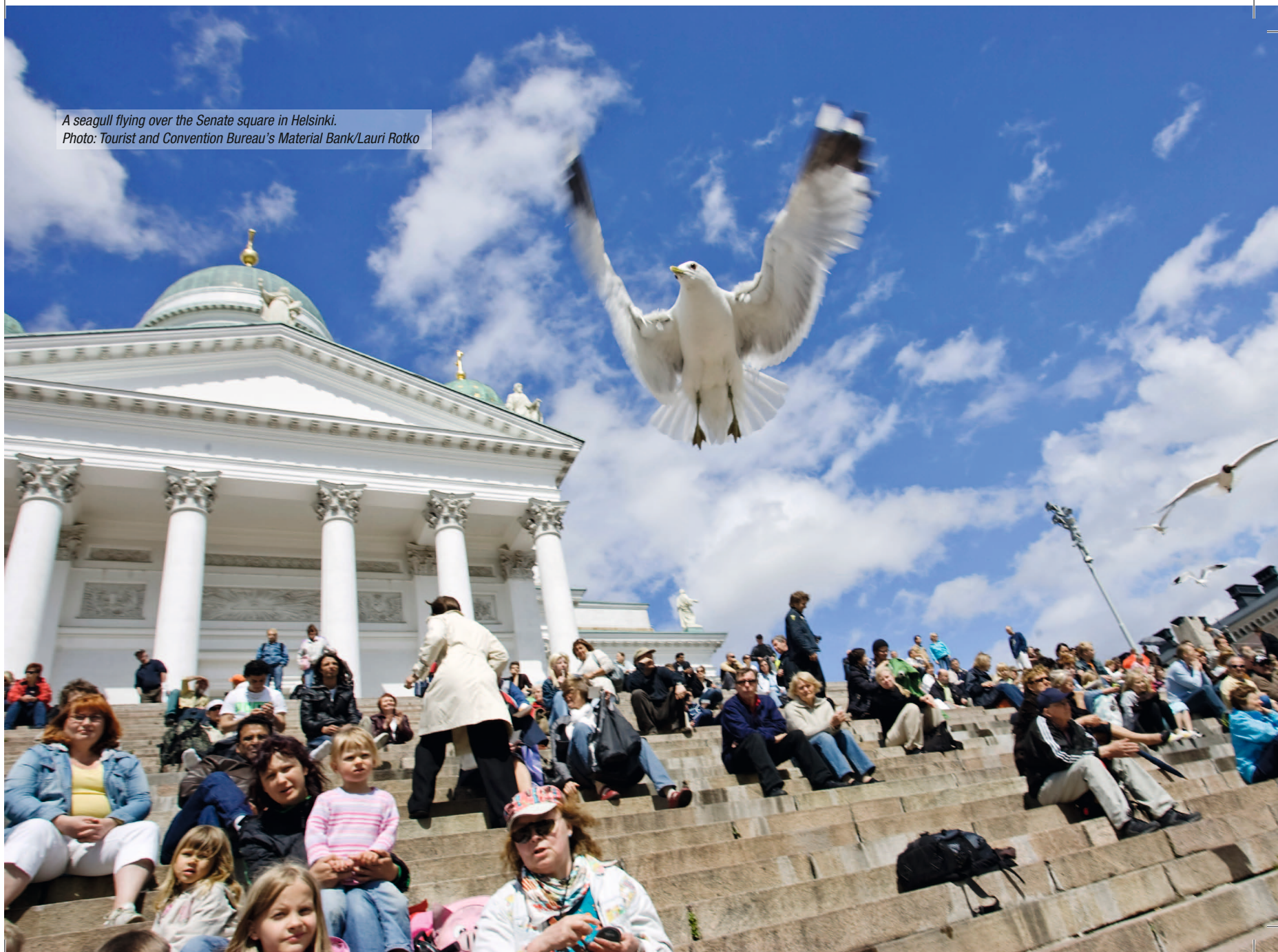
A seagull flying over the Senate square in Helsinki.