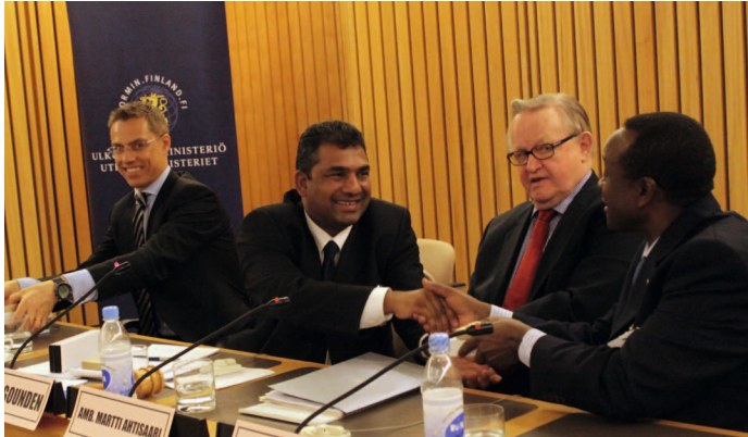
Foreign Minister Alexander Stubb and former President Martti Ahtisaari together with African partners Deputy Chairperson Erastus Mwencha of the African Union Commission and Vasu Gounden of ACCORD (South Africa) at a peace mediation seminar co-organized by Finland in Addis Abeba, March 2009.

Mediation plays a key role in the peaceful settlement of disputes, in conflict prevention and in conflict resolution. Finland and Turkey established a Group of Friends of Mediation at the United Nations in September 2010. The tasks of the Group are to promote the use of mediation as well as to generate support for the further development of mediation. The African Union and several African countries are members of the Group.