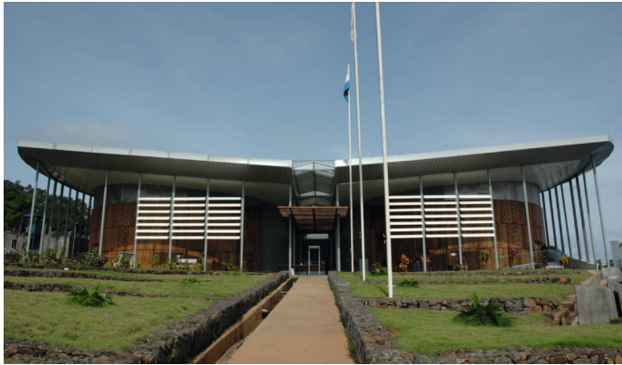
The Special Court for Sierra Leone was established in 2002 in Freetown, Sierra Leone.

A comprehensive approach to conflict prevention, crisis management, crisis resolution and post-conflict recovery is a must in Africa. Together with African partners, Finland has established an African Peacebuilding Coordination Programme (APCP). Finland is also a committed contributor to the UN Peacebuilding Fund.