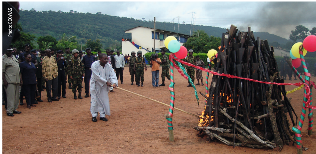
Illegally sold small arms and light weapons being destroyed. Ghana, 2008.

Since 1990, Finland has supported the implementation of the Chemical Weapons Convention in many African countries. The Finnish Institute for Verification of Chemical Weapons (VERIFIN) in Helsinki trains chemists from developing countries in the analytical skills necessary to reliable verification of the complete ban on chemical weapons enshrined in the Convention. Scientists from some 40 African countries have participated in VERIFIN courses over the years.