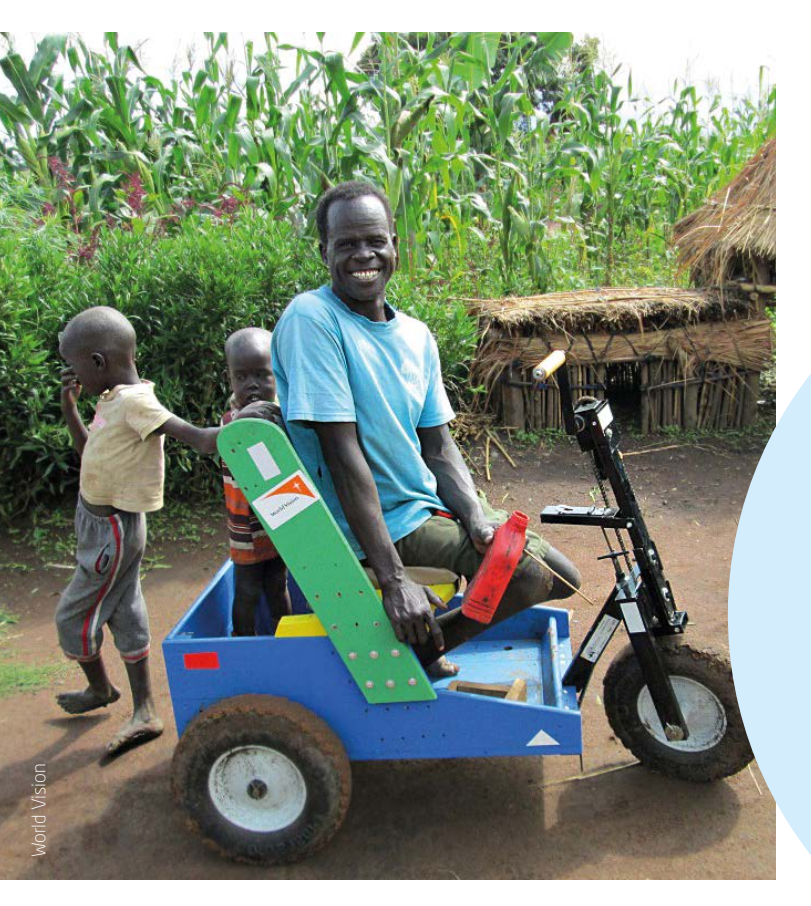
With support from the Ministry for Foreign Affairs of Finland, World Vision has implemented disability inclusive humanitarian operations in Uganda.

Finland is committed to ensuring that persons with disabilities have access to services essential for their survival, protection and recovery during and in the aftermath of crises.