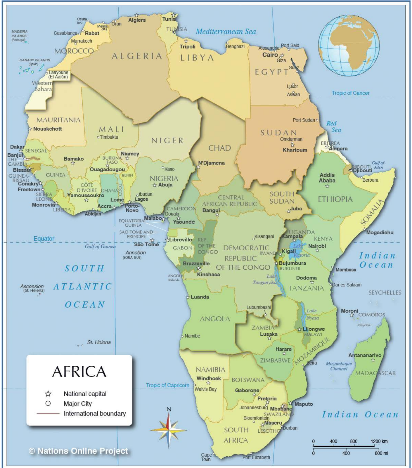
North Africa, West Africa, East Africa, Central Africa and Southern Africa.