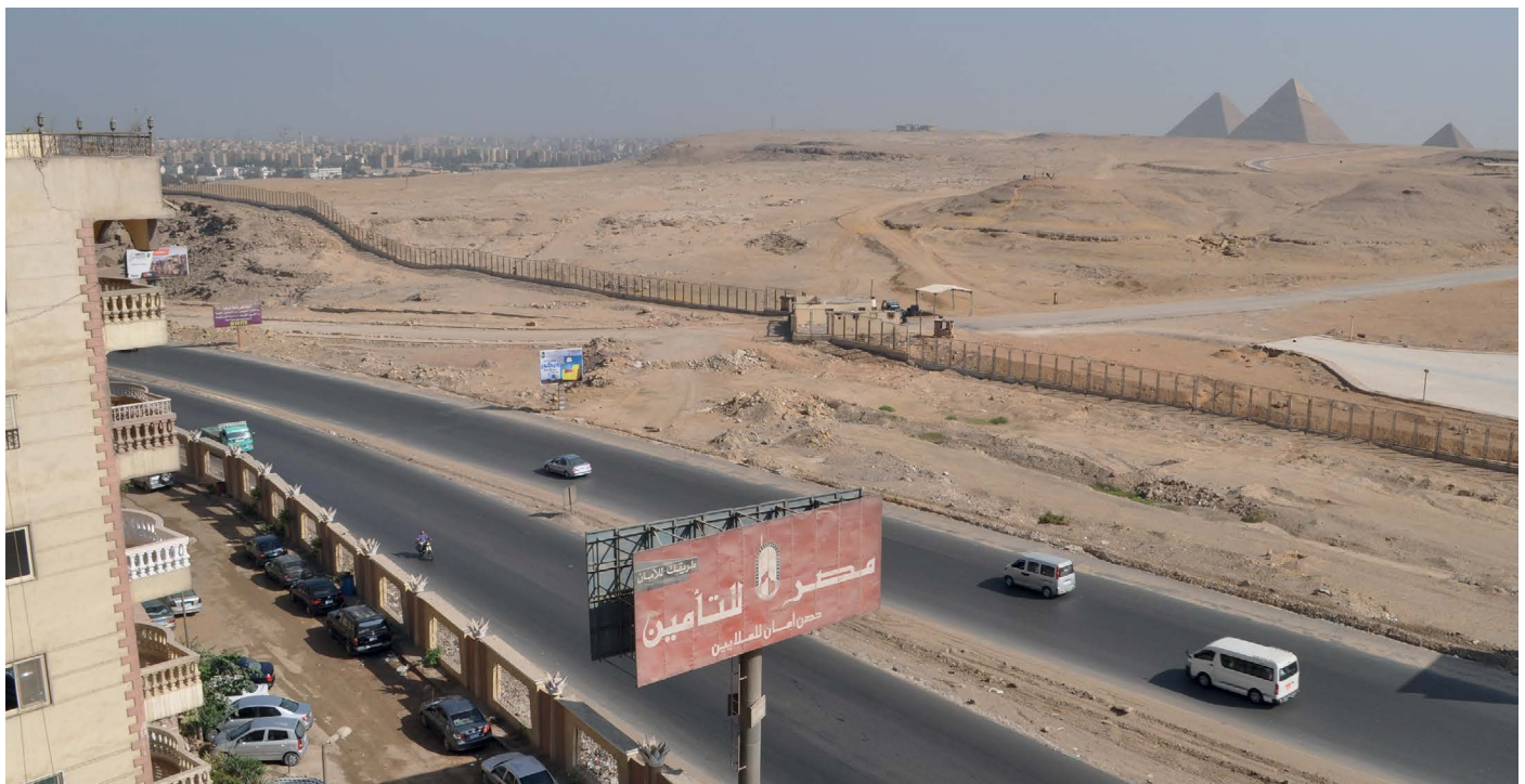
Giza pyramids are encircled by the growing urban area of Cairo. Photo: Petri Pellikka, 2015.

Insufficient infrastructure and institutional capacity also contribute to urban inequality and segregation. In addition