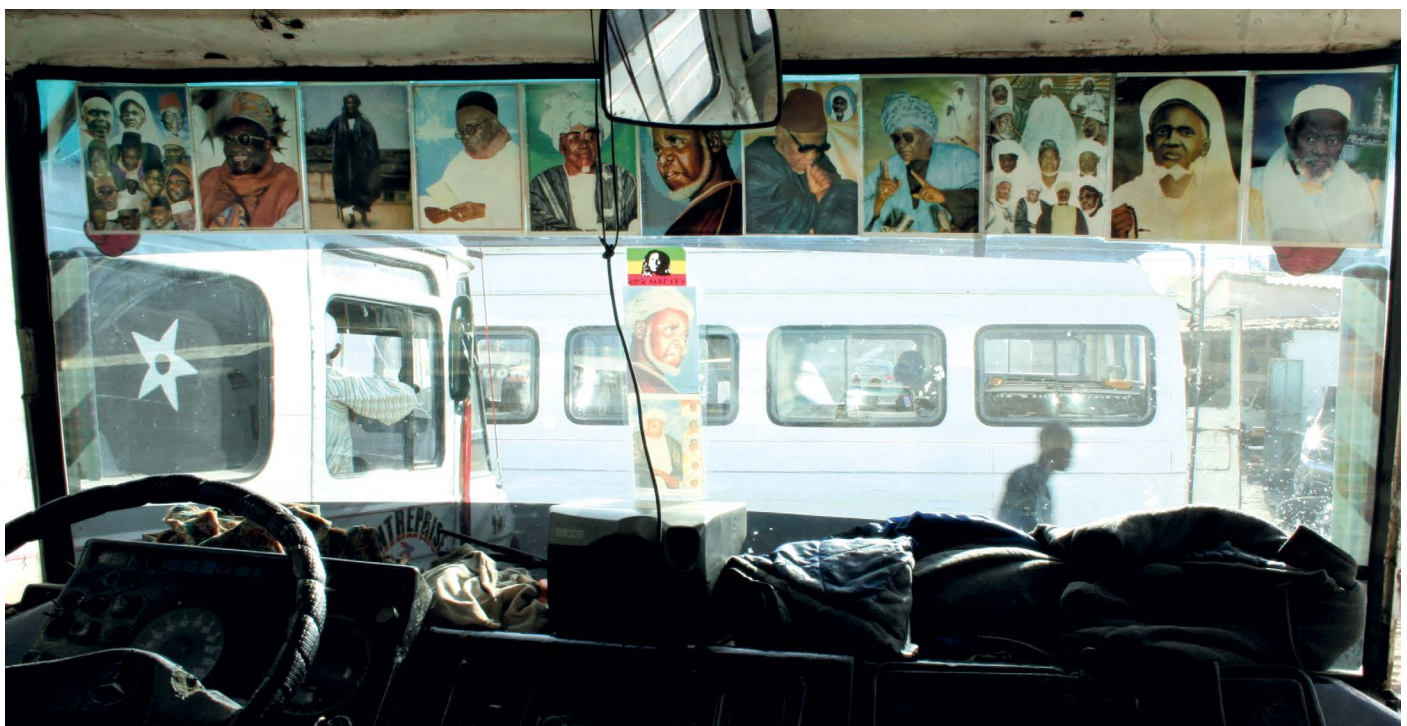
The journey from Senegal to Gambia takes a whole day with local transportation. Pictures of religious leaders are thought to protect travelers.

In West Africa , ECOWAS's Protocol Relating to Free Movement of Persons is in theory allowing free movement in the signatory countries. In practice, migration in the area remains restricted and many migrants rely on smugglers or undertake irregular crossings. However, it is worth noting that most migration in the area remains voluntary and occurs for economic and educational reasons. On the other hand, both