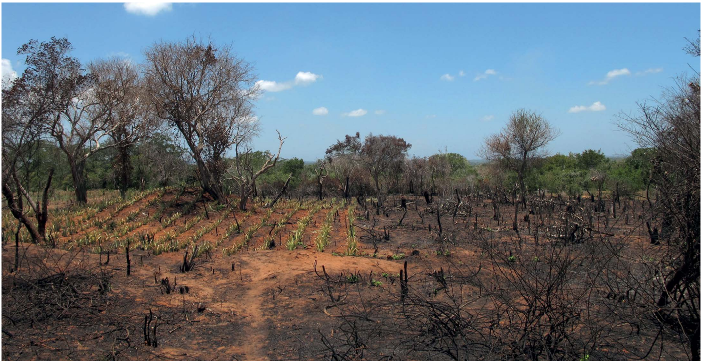
Bushland has been burned and cleared for a pineapple plantation in Dakacha, Kenya. Photo: Petri Pellikka, 2009.

Precipitation is likely to decrease over Northern and Southern Africa, while projections indicate increased precipitation and extreme rainfall in the highlands of East Africa, e.g. in Ethiopia. However, together with decreased vegetation cover and intensified rains, water cannot be stored in vegetation and soil. This causes intensified surface flow, decreased groundwater generation, soil erosion and flooding during heavy rains and droughts during dry seasons, and as a result fresh water resources are subject to hydro-climatic variability. Climate change impacts will be superimposed