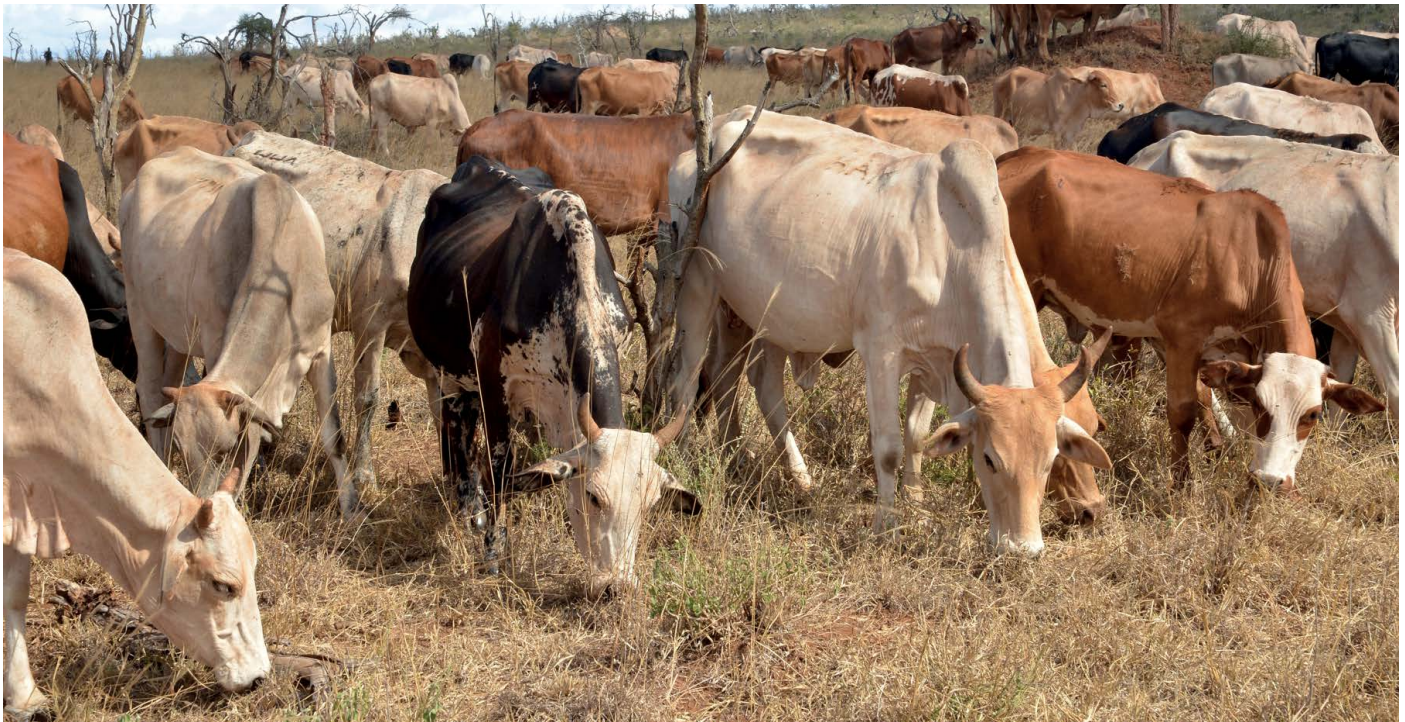
Overgrazing causes land degradation. Photo: Petri Pellikka, Kenya, 2018.

onto already stressed catchment areas with complex land uses and decreased land cover.