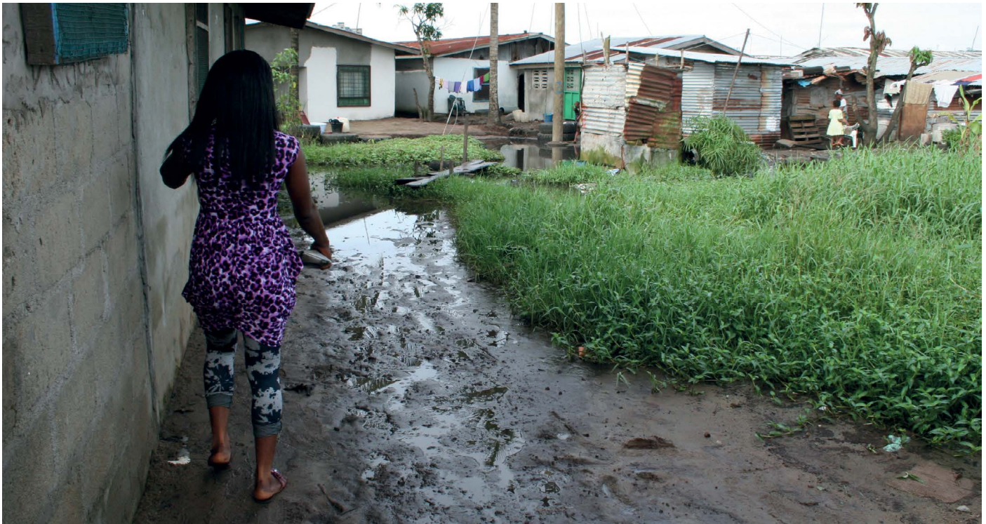
Inadequate sanitation infrastructure and poor water quality are a major challenge in Liberia particularly during the rainy season. Photo: Leena Vastapuu, 2012.

to poverty, insecure employment leads to marginalisation and lack of access to decision-making. In some cases, such as in Northern African countries during the so-called Arab Spring of 2011, this may lead to public protests, but more often dissatisfaction is left to deepen. The urban poor have a lower rate of access to education as well as health and other basic services, and are therefore disenfranchised from adopting new livelihoods or other opportunities. Women and girls are particularly disadvantaged by a lack of access to education as well as insecure or exploitative work circumstances. Inadequate infrastructure and services also present challenges to other special needs groups, particularly those with disabilities. The poor and otherwise marginalised groups are also disproportionately affected by criminality, violence and other forms of insecurity, such as environmental risks, as will become clear in the following section.