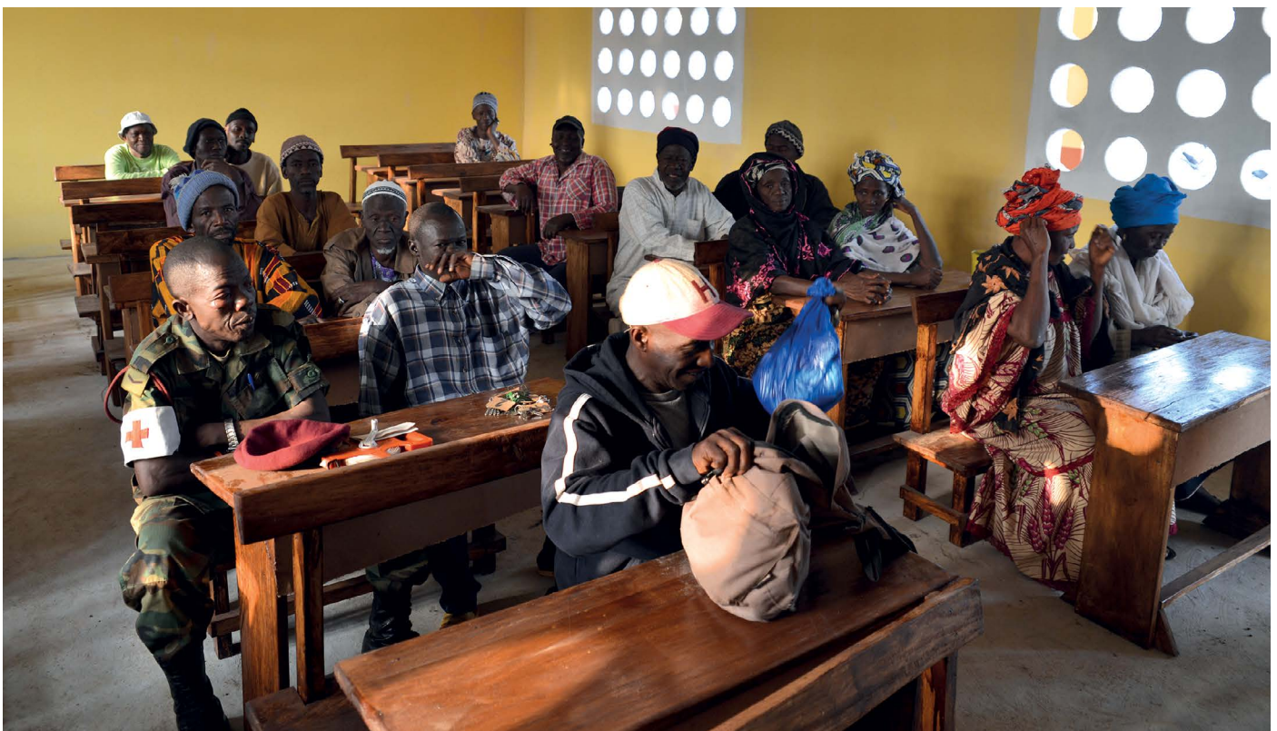
Villagers in Sanya, Sierra Leone have gathered to discuss the plans of a development project on biocarbon.

For Western governments, the situation is not easy. Traditional development aid is increasingly seen in many developing countries as failing to deliver rapid economic development on its own. Critical voices have also been raised from within the expert community with regard to the ability of development aid to improve macroeconomics. EU governments are hard-pressed to directly compete with China's economic offers and infrastructure-building prowess, although the EU has vowed to boost its investments in Africa 5 . A piecemeal approach to political values, such as focusing on minorities' or women's rights, while important as such, risks giving the impression that EU governments' development policy is driven mainly by current Western political priorities,