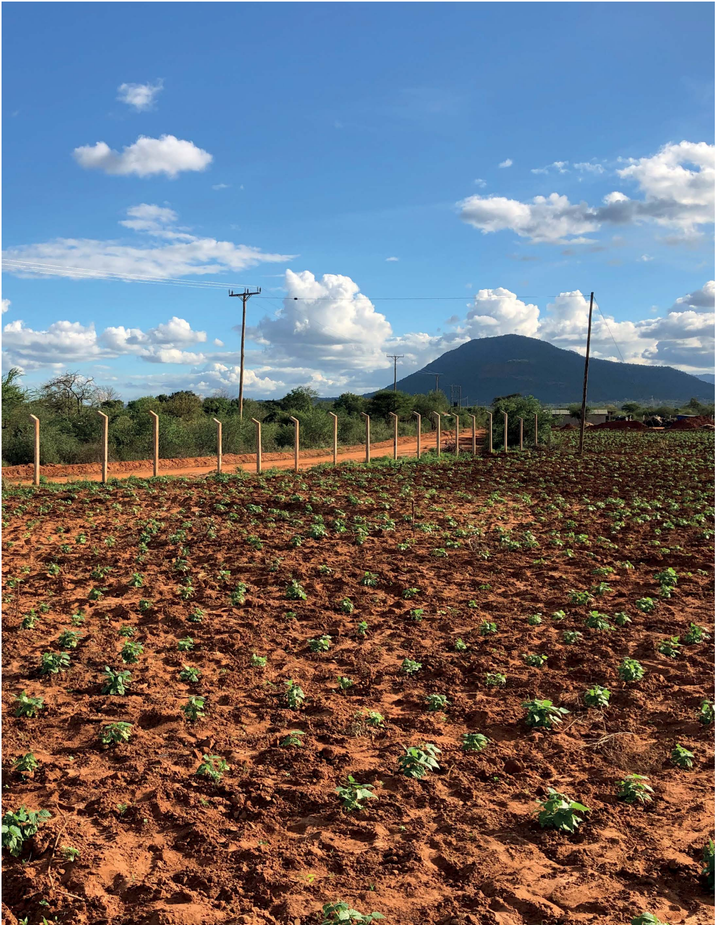
Bushland is cleared for large-scale commercial agriculture in Taita Hills, Kenya. Photo: Petri Pellikka, 2019.