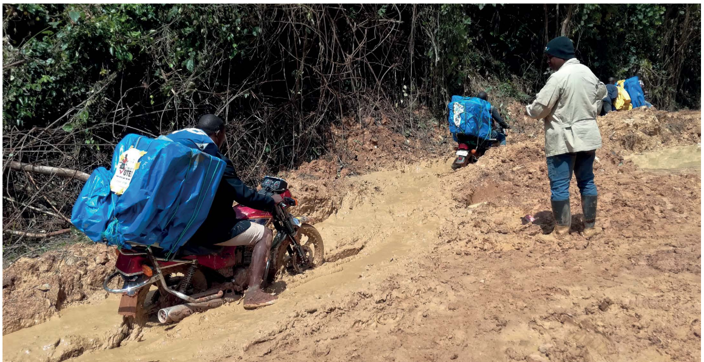
A police officer was supervising the transportation of ballot papers in Liberia in 2017.

Overall, there has been progress in the institutionalisation of political parties and elections. Many basic requirements for a functioning democracy have also improved, e.g. the legal framework, independent ju-