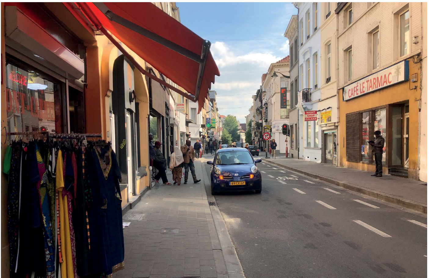
African quarters few kilometers from the headquarters of the European Commission in Brussels. Photo: Petri Pellikka, 2019.

challenge include a range of traditional survey instruments, as well as more innovative technologies, such as drones and satellite imagery, yet the latter two come with unanswered security concerns attached. Finally, better data would also encourage evidence-based discussion on African migration patterns in regions outside of Africa, and thus reduce xenophobia as well as hasty political decisions that may carry severe unintended consequences in the long term.