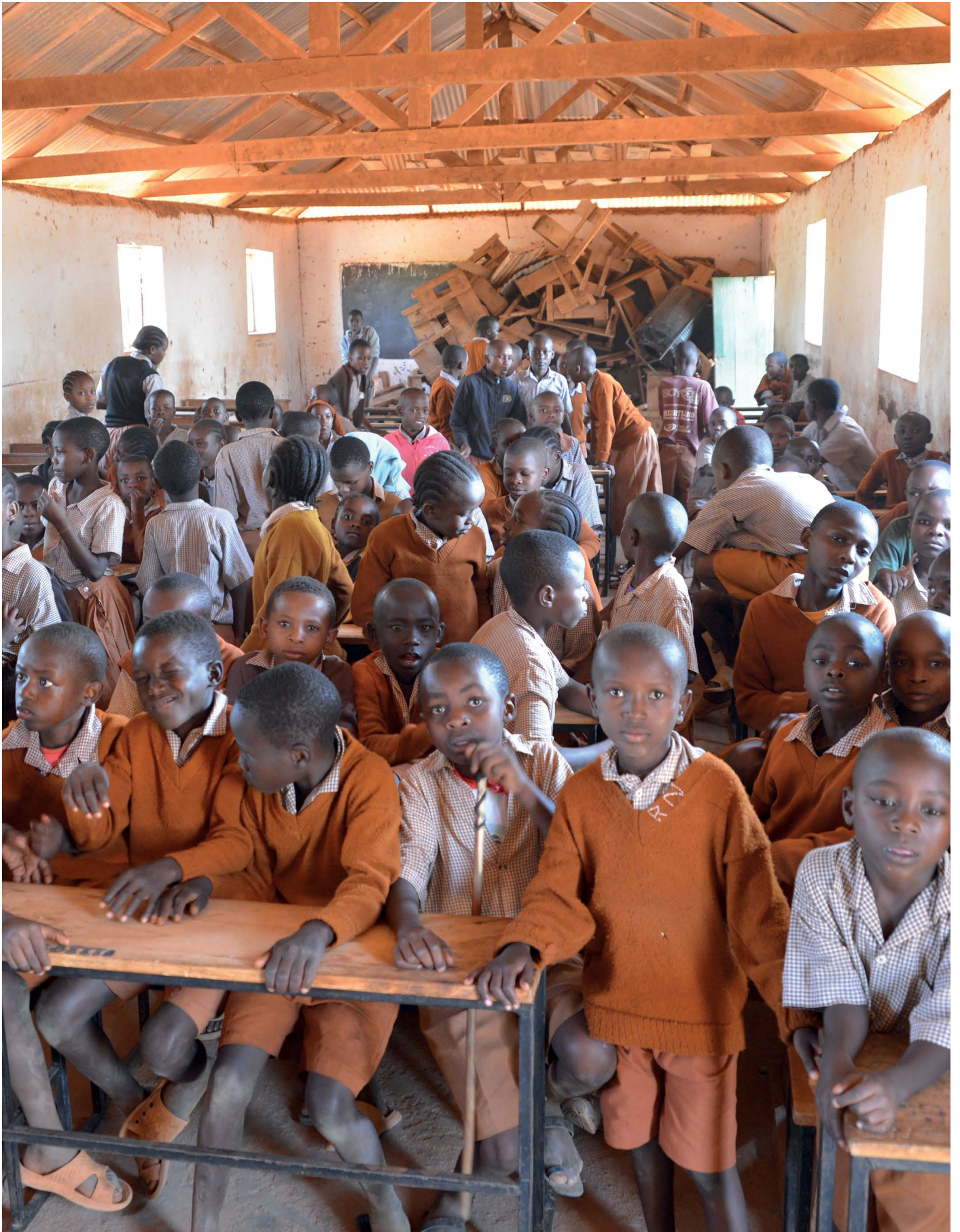
Pupils of Maktau primary school in Kenya ready for class to start. Photo: Petri Pellikka, 2014.