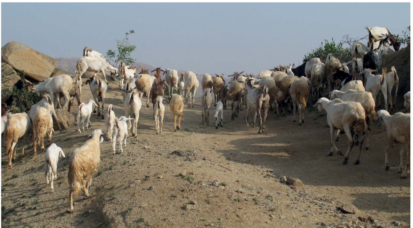
Goats heading towards an unknown future. Photo: Petri Pellikka, Eritrea, 2015.

tainable development and eradicating poverty.’ More specifically with regard to Africa and development policy, EU governments should focus more on well-targeted investments in education, training and basic infrastructure, as well as advising on good practices. Africa’s future is bright, if we work in the right direction together.