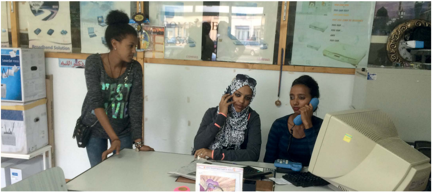
Telephone landline and mobile phone in use in a computer shop in Asmara, Eritrea.

power of a similar-sized power plant in Germany. In some parts of coastal Africa, strong wind capacity has pushed governments to plan large-scale investments in wind power, whereas basically every farmer with a cow has the potential to participate in biogas production.