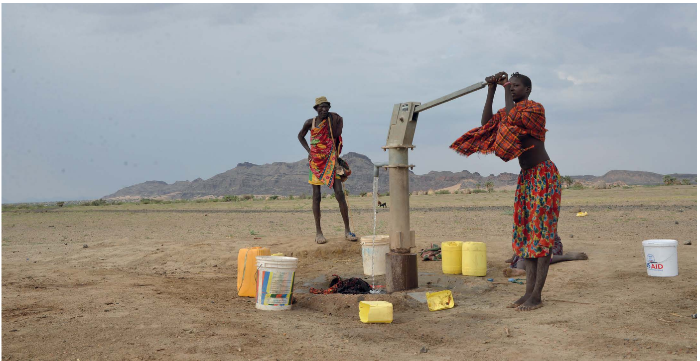
The water pump is often still the most important technological achievement in Africa like here in Turkana, Kenya.

a high potential to increase human insecurity, vulnerability to climate change, as well as harmful environmental impacts. These impacts are also interlinked and tend to exacerbate one another. In particular, they adversely impact those who are already the worst off, such as people living in marginalised communities.