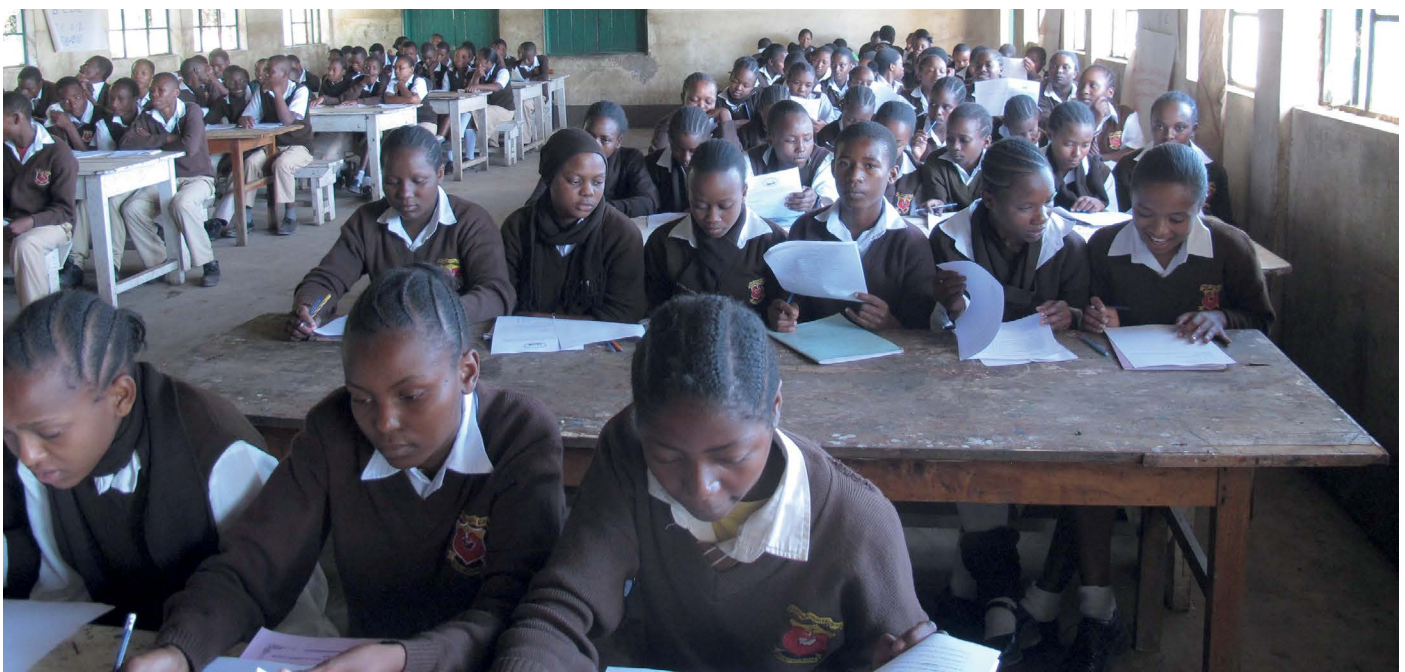
Education among females in one of the key solutions to reduce birthrate and population growth. Photo: Petri Pellikka, Kenya, 2013.

All in all, high population growth has already pushed African governments to their limits