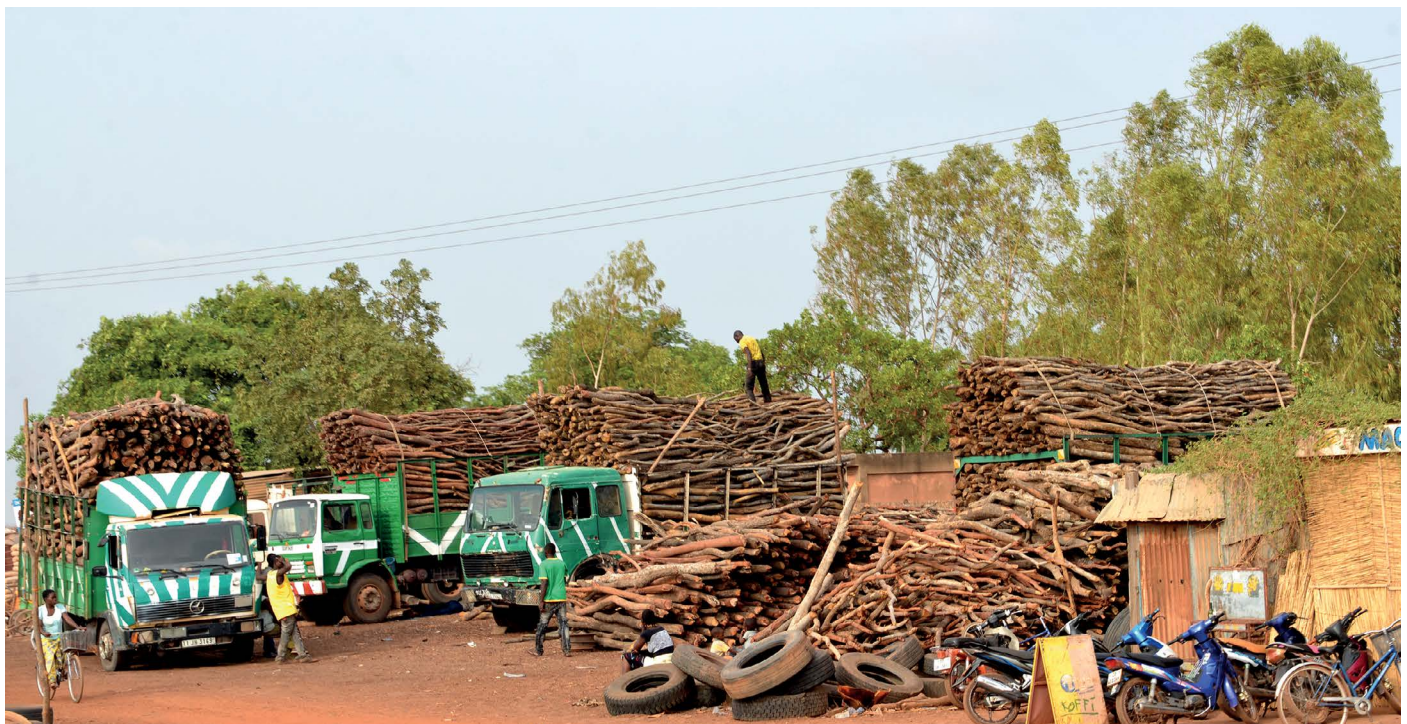
Piles of firewood on the outskirts of Ouagadougou in Burkina Faso. Photo: Petri Pellikka, 2015.

Agroforestry practices allow farmers to generate income from wood-based energy and raw material for building as well as from carbon compensation. CSA practices, including natural tree generation, tillage, terracing and mulching, are strengthening resilience towards extreme events and are improving livelihoods. Community-based carbon offset and agroforestry schemes provide development benefits and help communities to adapt to and mitigate climate change. Integrated agroforestry schemes across Africa can have direct benefits for local adaptation, as they enhance agro-ecosystem (bio)diversity and resilience, as well as contribute to the global goal of limiting greenhouse gas concentrations in the atmosphere. IPCC's special report on Climate Change and Land, published in August 2019, provides five overarching issues for resilience in productivity: