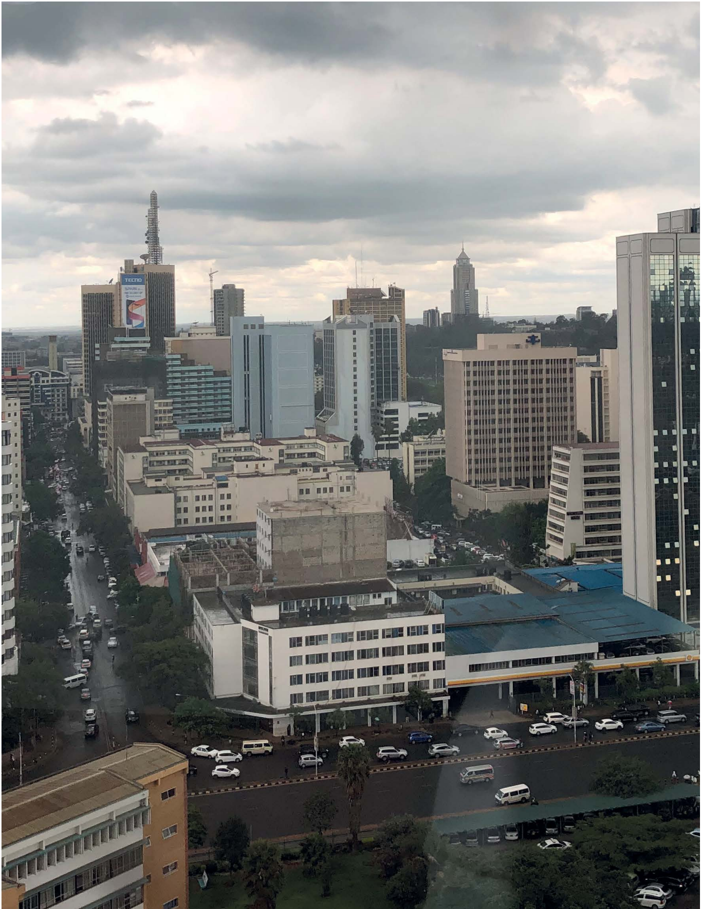
Downtown Nairobi is built denser and higher every year. Photo: Petri Pellikka, 2019.