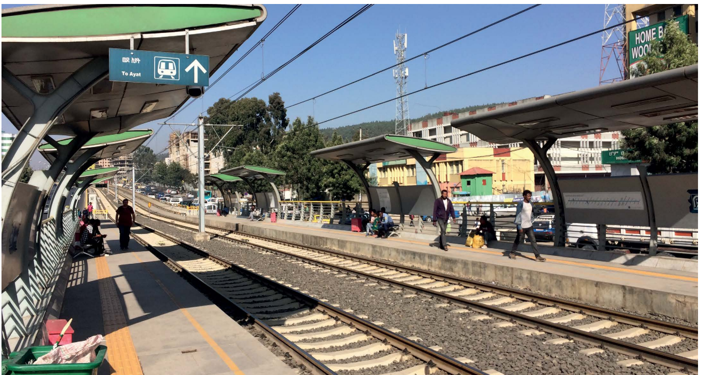
City light rail funded and built by the Chinese was opened in Addis Ababa in 2015.

Contrary to developments elsewhere in the world, urbanisation in Africa has not followed a straightforward path associated with structural transformation, economic growth or reduction in population growth. Therefore, levels of urban poverty, inequality and segregation remain high, and may continue to worsen as urbanisation continues. Unplanned and poorly governed urbanisation has