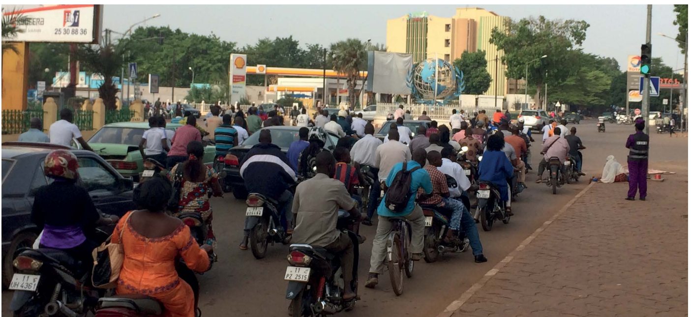
Lack of public transport causes traffic jams and air pollution in Ouagadougou as well as in other African cities.

In addition to mobile phone innovations, there are also other promising technological innovations occurring in Africa. In the renewable energy sector, hydropower is the biggest contributor (84% of the market) but it is rapidly being caught up by solar power innovations. With costs declining at an annual rate of 10%, solar power is already cheaper than coal in more than 30 countries. Importantly, a solar plant in Africa may produce double the