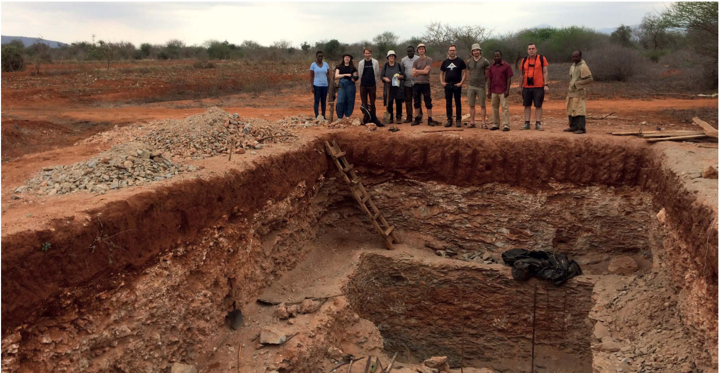
A farmer dug a pit using shovel and hoe in order to collect rainwater in the Tsavo plains, Kenya.