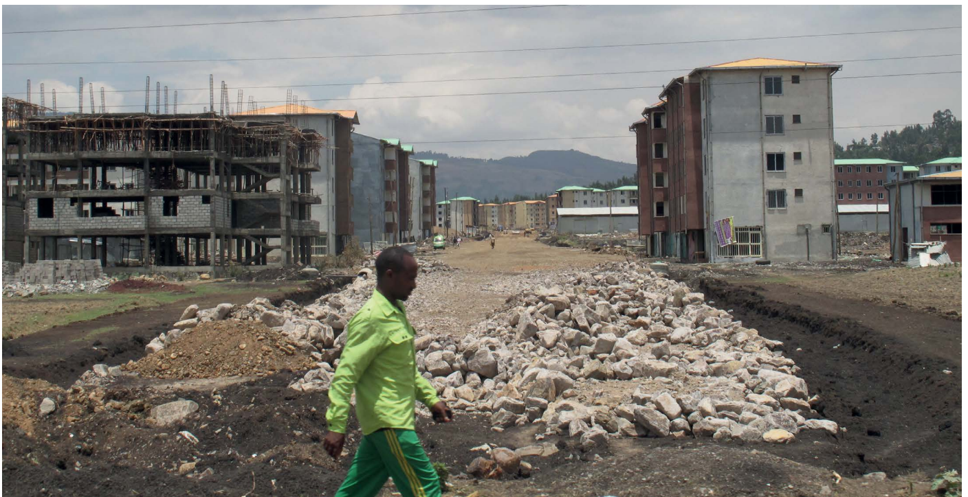
New houses for the middle-class in Addis Abeba. There will be a new street in the middle.

Improvements in urban infrastructure need to be planned in accordance with sustainable development goals. One priority is the provision of affordable housing, which can be promoted through private partnerships and improved land rights governance to improve the productivity of construction. In Mauritius, for instance, comprehensive land and housing management has turned the real estate sector into a driver of economic growth. Overall, co-production systems should be explored to help mobilise financing for infrastructure investment and promote the provision of services and employment. Public transportation systems and overall connectivity should leapfrog to low-carbon options. This will help to reduce environmental impacts and advance mobility, especially among