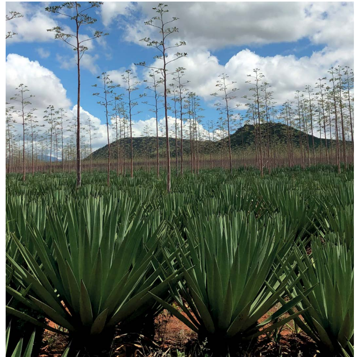
80% of the sisal fiber is exported unprocessed from Kenya, for example to China to be used in the textile industry. Photo: Petri Pellikka, 2019.

Here again, China is a factor. In recent years, Chinese companies have been active in moving some of their low-end manufacturing to Africa, with developments in Ethiopia being of particular interest.