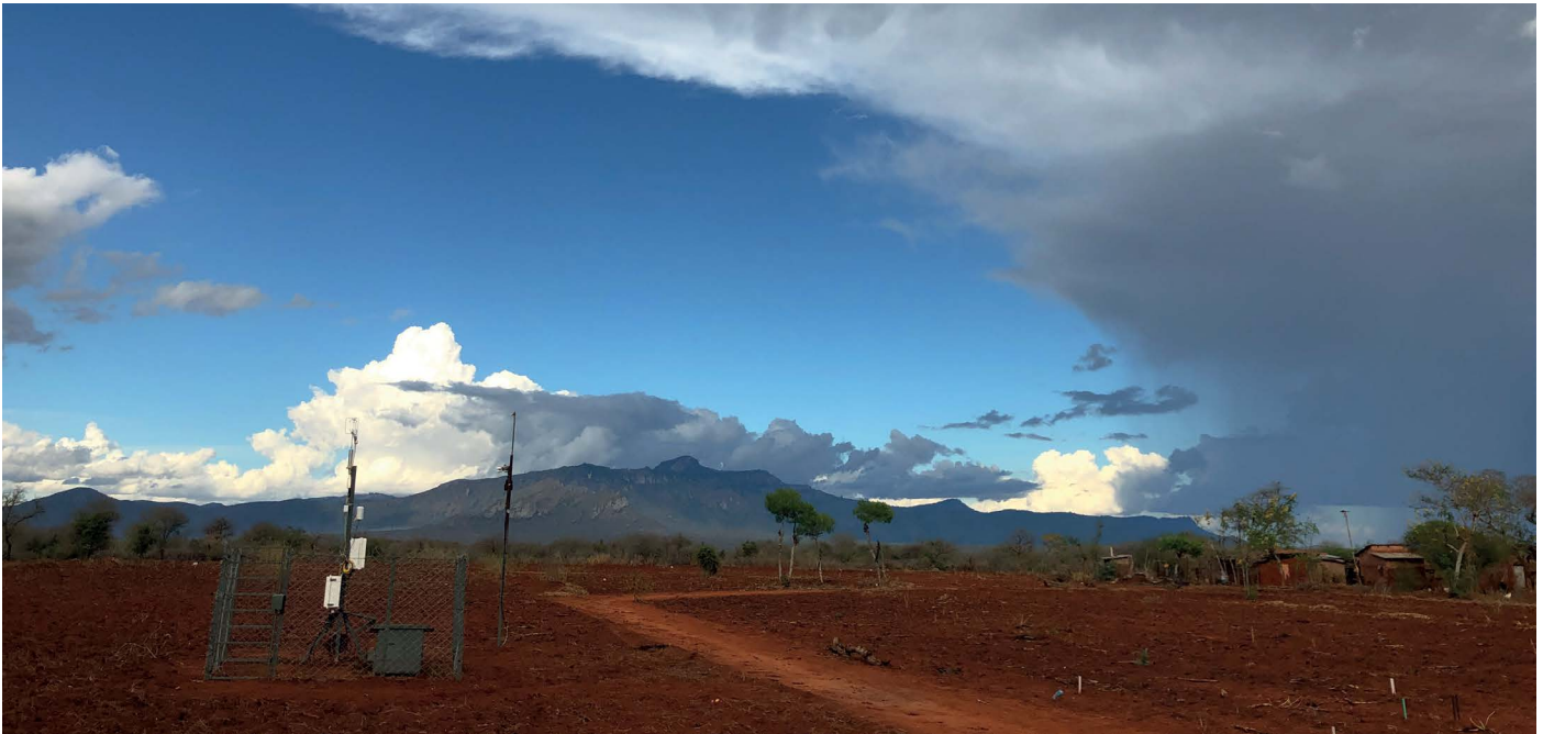
Taita Research Station of the University of Helsinki has established a station in Taita Taveta County in Kenya to measure greenhouse gas and energy exchange between atmosphere and biosphere.