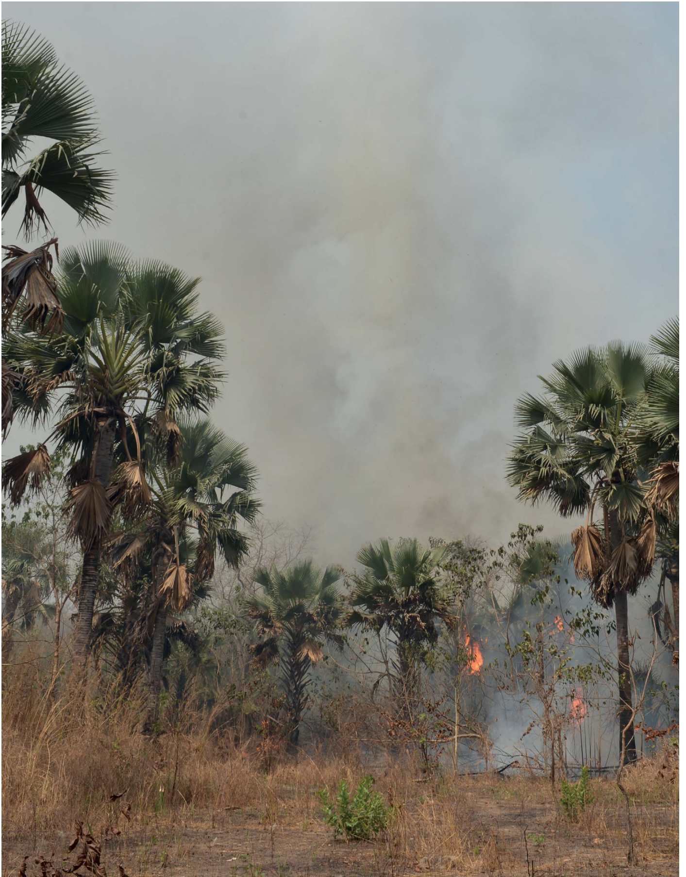
Dry grass is burnt after the dry season in the Sahel zone to trigger new growth. The fire reaches dry palm leaves and smoke spreads far away. Sierra Leone, 2014.