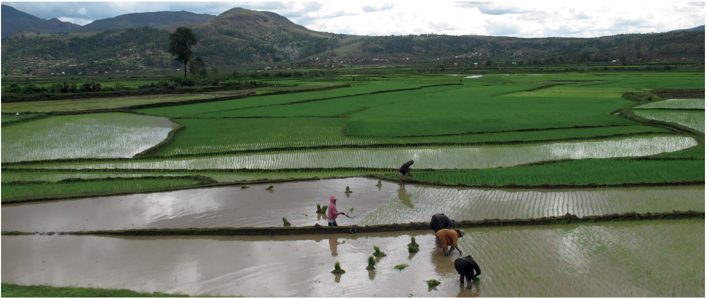
Rice fields make up the agricultural landscape in Madagascar. Photo: Petri Pellikka, 2013.

Kollikho, P. and B. Rivard 2013, Harnessing geothermal energy: The case of Kenya , CDKN, London.