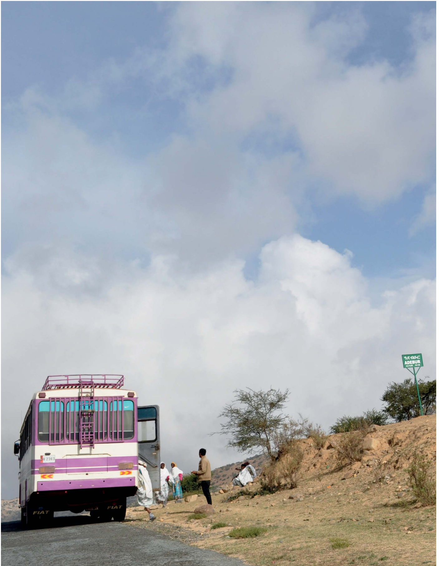
Emigration from Eritrea is one of the highest compared to other African countries.