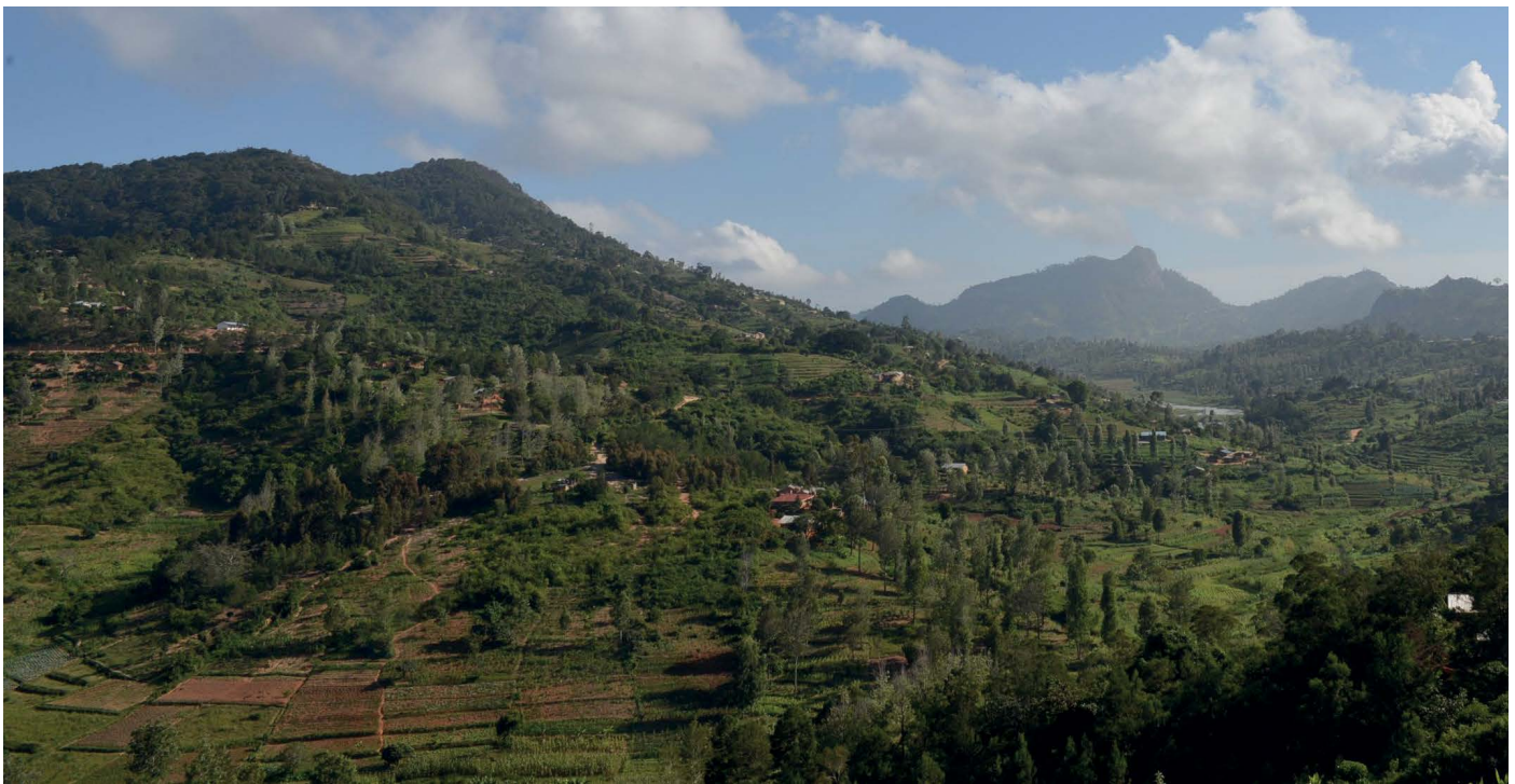
Climate smart agricultural landscape in the Taita Hills, Kenya.