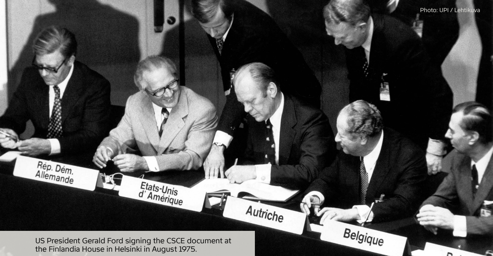
US President Gerald Ford signing the CSCE document at the Finlandia House in Helsinki in August 1975.